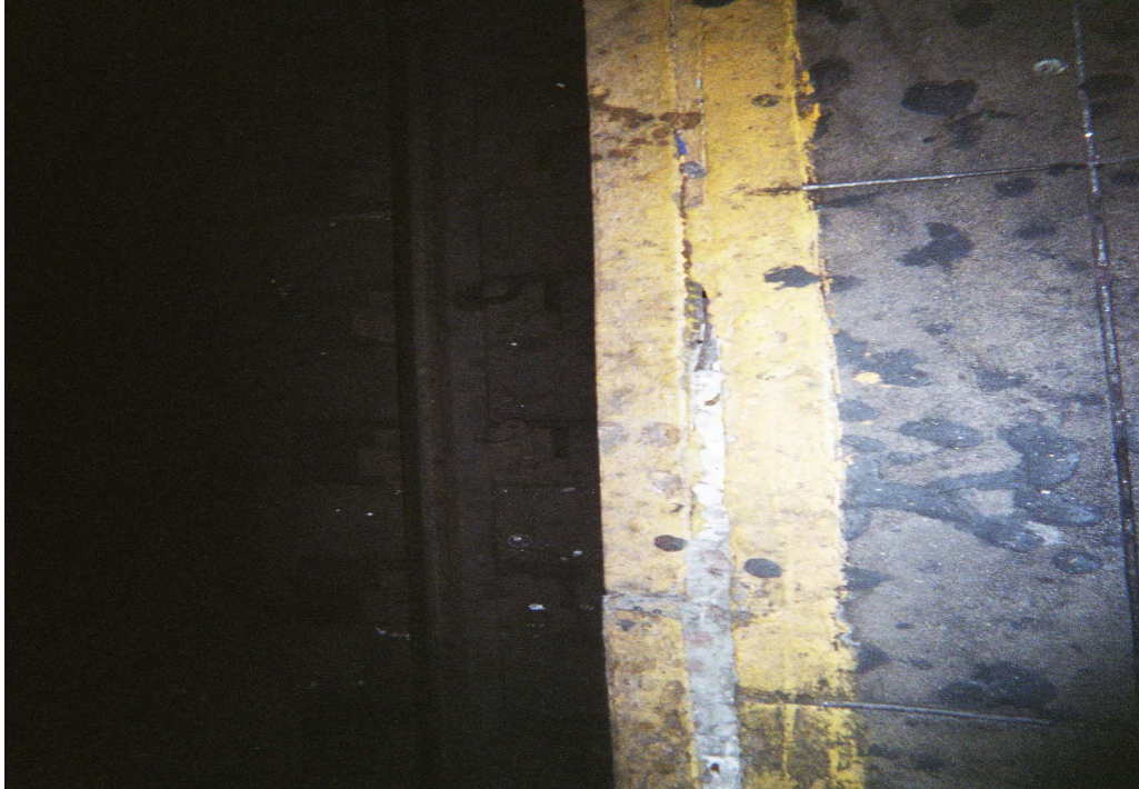
Holes in the platform at the entrance of the subway door at the Avenue M Station of the Q line.