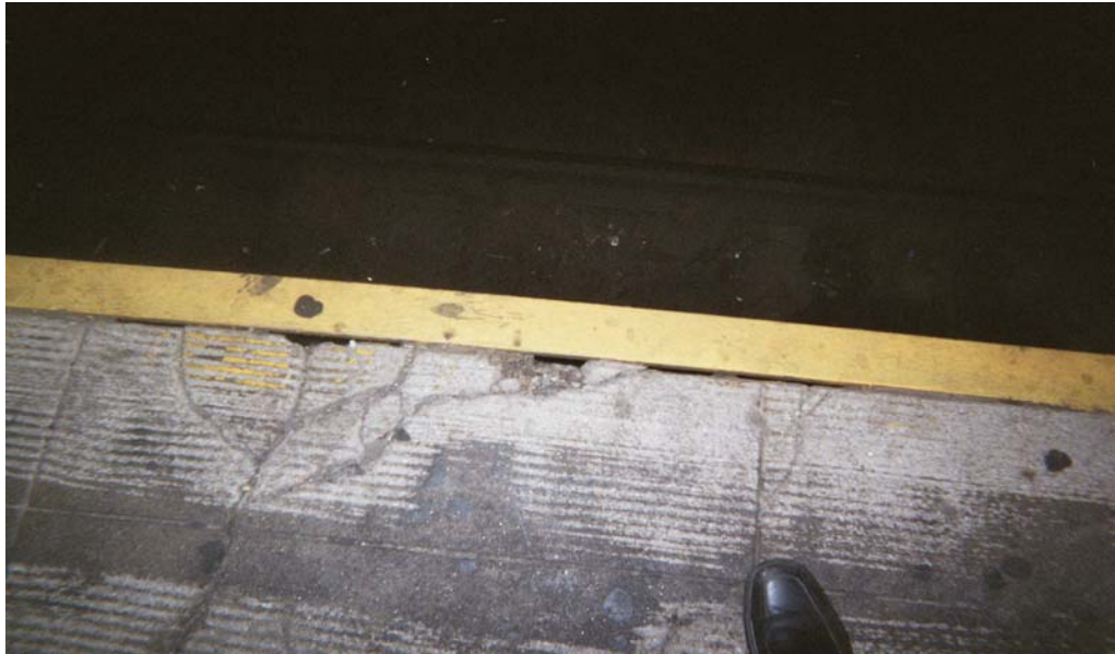
Corrosion throughout platform at the 4 th Avenue Station of the F line.